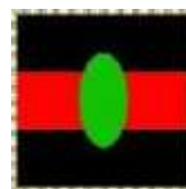
The AUR colour patch

and identify units. Upon integration with 9 Bde on 1 Jul 08, the unit was issued a new colour patch to reflect its training role, within Land Command. The tie is similarly distinctive with a quality AUR badge embroidered on the bottom RH corner of the tie.